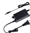
DC12V/2A Power Adapter